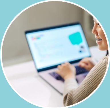
Work Experience Placements