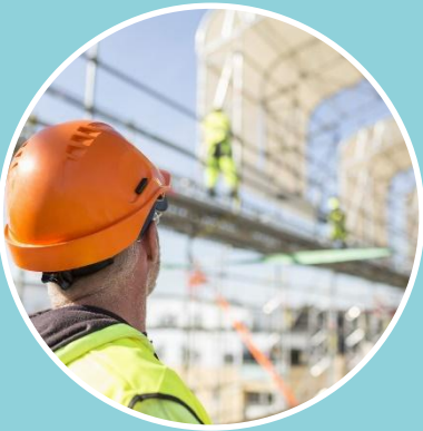
Project Initiated Apprentices