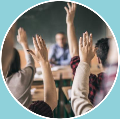
Educational Curriculum Activities