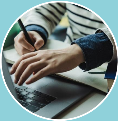
Existing Apprentices (Number of Weeks)