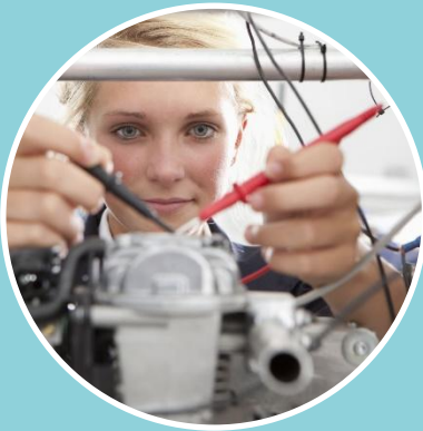
Trainees (L4 & Higher), Graduates and Interns